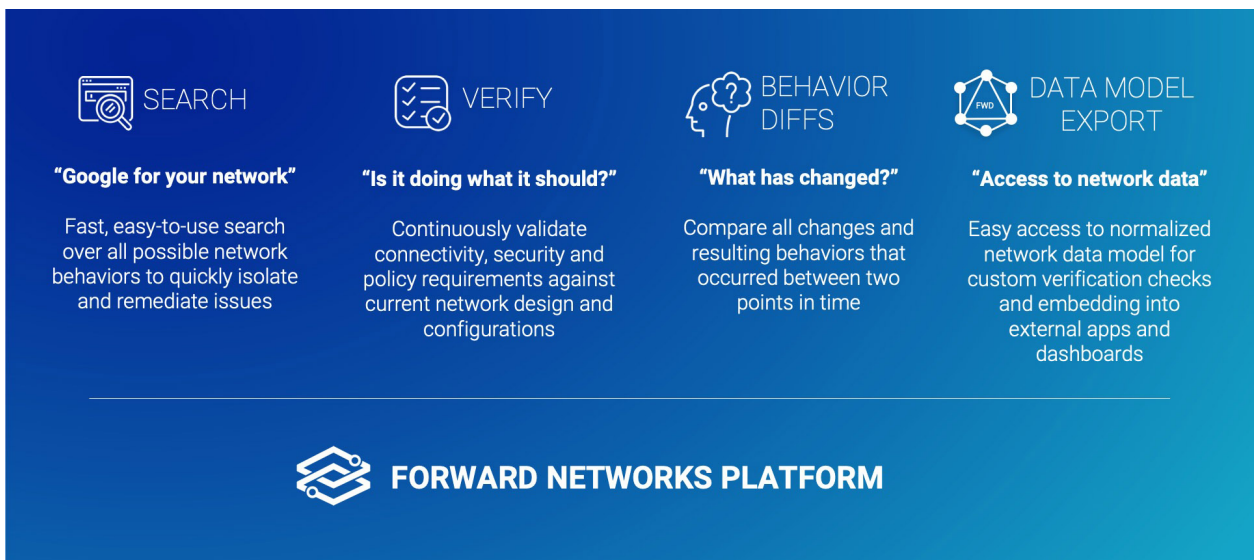
Figure 2 Forward Networks Platform

Forward enables organizations to describe their intended behaviors as sets of rules or policies that are continually checked to detect anomalies and avert future issues or compliance breaches. Users can quickly analyze and remediate issues, while automating verification tests on proposed changes to shorten change windows, reduce roll-backs and accelerate network deployments. See Figure 2.